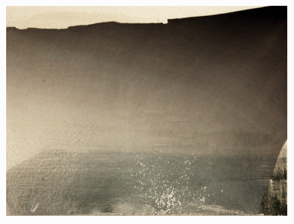
Mara de Luca, DuskVeil, acrylic painting on silk and canvas, 18 x 24 inches

This produces broad areas of subtly shifting color that mimic the mistiness and visual ambiguity of forms as seen at dusk against the Los Angeles hills. The colors are either stark, black and grays, with white or electric-orange bright spots, or thin, transparent blues and greens against hot oranges. There is a satisfying calmness, a certain emotional distance, in much of the work, a pervading serenity and silence.